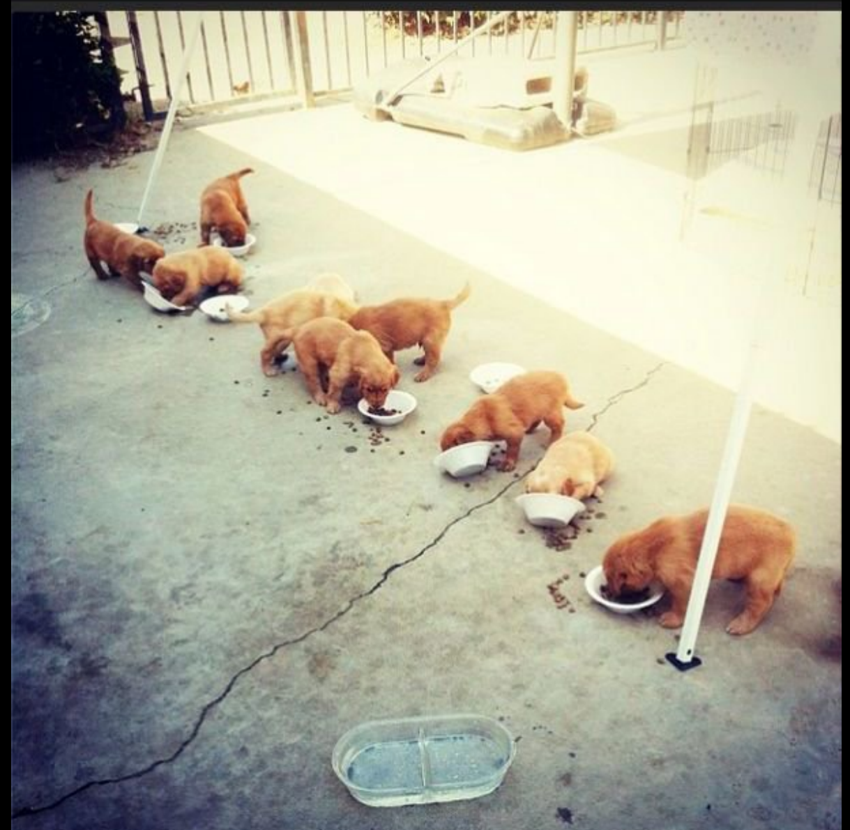
What my students think I do